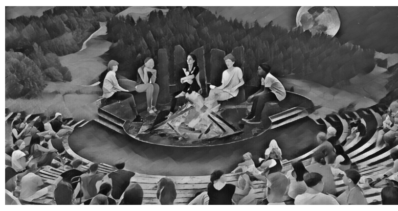
The goal of this technique is to collectively "remember" one of the many stories that grew into our utopia.

You have been chosen as members of this year's Assembly for the Future. Your sacred task is to lead the opening of the Festival of Remembrance where you collectively remember how each of your Ancestors came together to overcome the Challenges of the world before. To secure the utopia we've won, Assembly Members must project their minds backward into one of the many pivotal moments in our legacy of freedom.